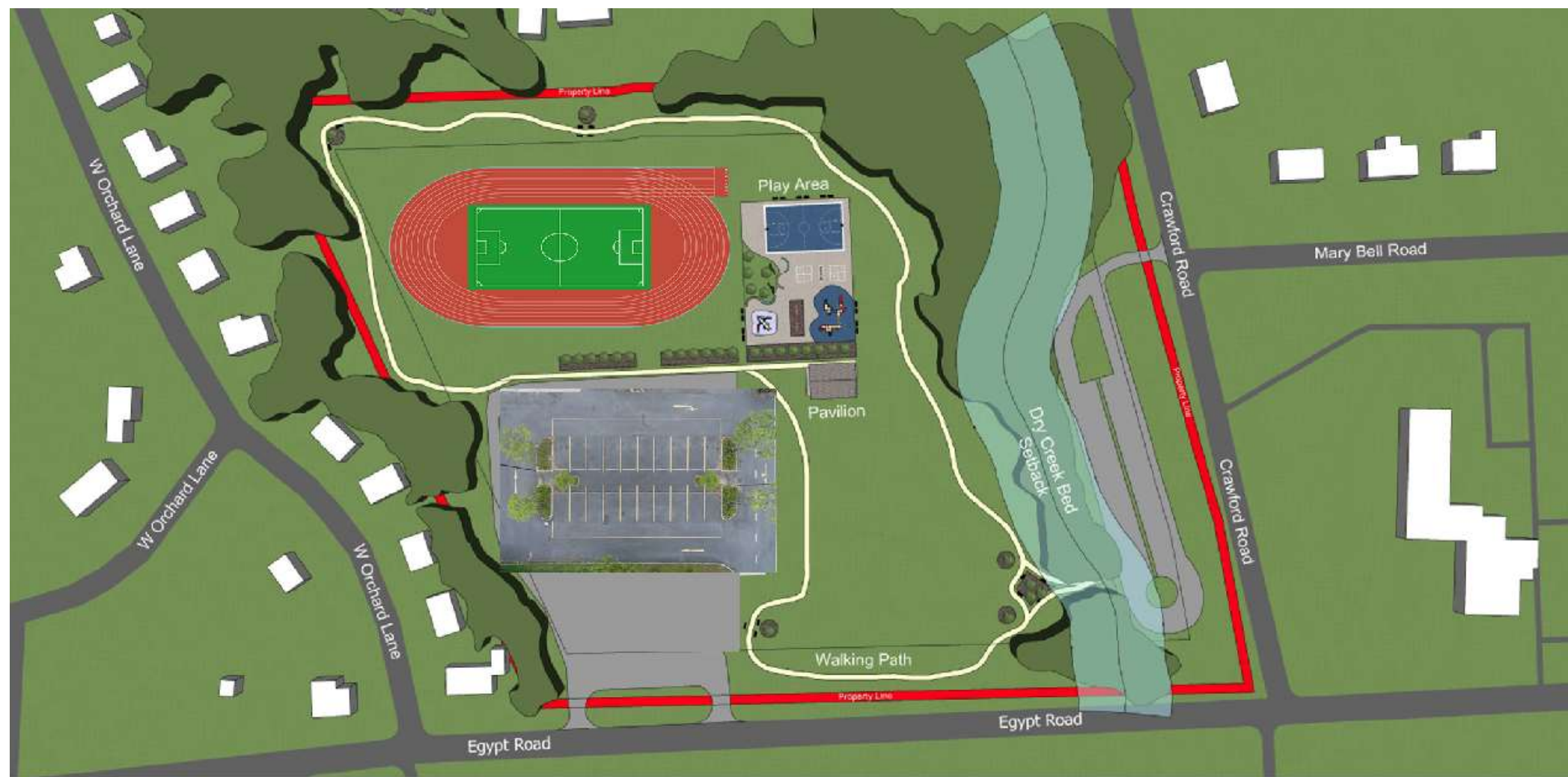
Potential Arcola/Skyview All Purpose Field with 6 lane track + Community access